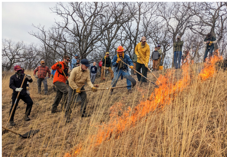
TPE burn training at Pleasant Bluff.

Wisconsin Department of Natural Resources (WDNR) website is a web of learning opportunities. From wildlife to native plants and natural communities, it is a great place to start.