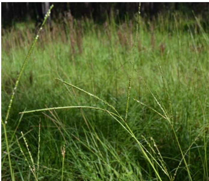
Various warm-season grasses, including bahiagrass (pictured), can also be problematic in NWSG stands. Herbicides are the best option to control these species.

Other problematic nonnative warm-season grasses include bahiagrass, bermudagrass, Chinese silvergrass ( Miscanthus spp.), cogongrass, crowngrasses ( Paspalum spp.: dallisgrass and vaseygrass), large crabgrass, jangrass, and old world bluestems. Bahiagrass and bermudagrass are forage grasses most commonly planted in the southeastern United States, but bermudagrass occurs throughout the eastern United States. Jangrass is a common invasive annual grass in forested areas, but it can invade NWSG stands. Ideally, these species should be controlled with herbicides prior to planting, but they also commonly encroach into established NWSG stands. Some of these grasses can be controlled without harming some planted native grasses, but others require herbicides that also kill planted native grasses. Grass-selective herbicides generally are not effective at controlling perennial grasses.