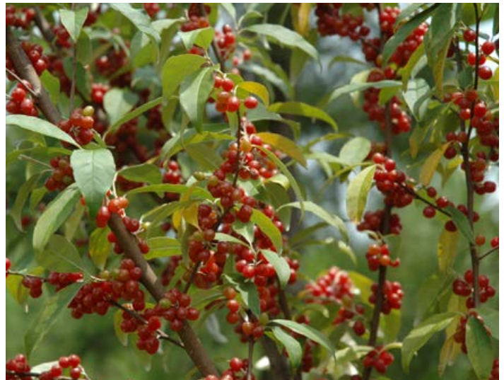
Nonnative olives are commonly spread across NWSG fields by birds dispersing seed. Olives can quickly invade open areas and they should be controlled with herbicide.

Nonnative olives. Nonnative olives (autumn, silverthorn, Russian, and others) are woody shrubs commonly planted in the mid-20th century to provide cover and food for wildlife. When occurring adjacent to a NWSG field, they usually spread throughout the field and may create dense thickets within the field, which can be desirable for some wildlife species, but they are problematic as an invasive species. Nonnative olives can be controlled with foliar applications of triclopyr (Garlon 4®, 4–8 qt/ac) or imazapyr (Arsenal®, 4–6 pt/ac), whereas glyphosate and metsulfuron methyl typically provide limited control.