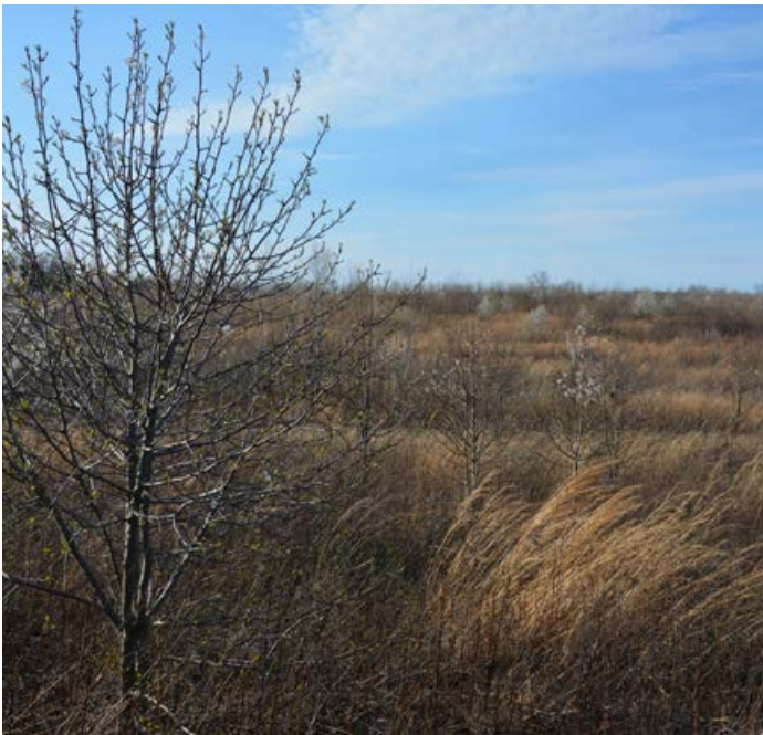
The trees with white flowers invading this old-field in southern Indiana are Callery pears. Pears are easy to identify in the spring, because they generally are the first trees to flower. This picture was taken in early March, prior to most trees breaking dormancy.

Callery pear. Callery or Bradford pear is an ornamental tree used widely in residential landscaping. Originally thought to be incapable of reproducing naturally, varieties of callery pear can cross-pollinate and have become extremely invasive and commonly invade NWSG stands. It typically appears sporadically, but then forms extremely dense clumps that outcompete native herbaceous and woody vegetation. You should aggressively try to control this plant. Callery pear can be killed with glyphosate (2% solution [2.6 oz/gal of water]), imazapyr (Arsenal®, 1.5% solution [2 oz/gal of water]), metsulfuron methyl (1 g/gal of water), or triclopyr (Garlon 4®, 2–4% solution [2.5–5 oz/gal of water]).