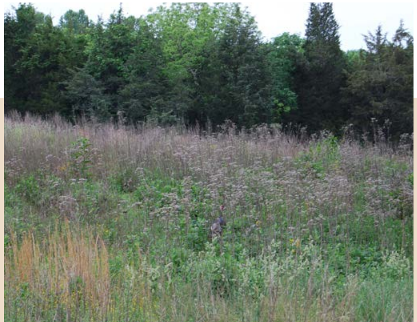
This field dominated by broomsedge, late boneset, wingstem, and horseweed was a tall fescue and orchardgrass pasture just 2 years before this picture was taken. All that was done to this field was a late-fall application of glyphosate followed by burning in March. Planting was not necessary. Now it provides excellent cover for many wildlife species including the wild turkey in the center of the picture.

After the seedbank has germinated, herbicides can be used to control undesirable plant species. If vegetation emerging from the seedbank is not desirable, spot-spray undesirable