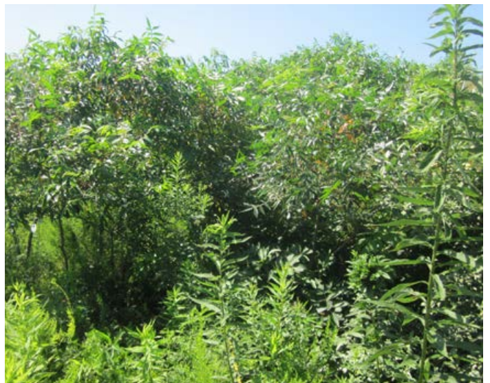
Sumac mottes provide excellent thermal cover during the heat of the summer for bobwhite, turkeys, and white-tailed deer. However, sumac can become too dense if not managed.

Native shrub species, such as plums, hawthorns, elderberry, dogwoods, sumacs, leadplant, and false indigo, are extremely attractive to many wildlife species that need woody cover and make planted NWSG fields much more desirable to these species. However, you need to provide the correct amount of woody cover in an attractive arrangement for various focal species, and as succession advances, even some of these shrubs can become too dense for various species and management will be needed to control them.