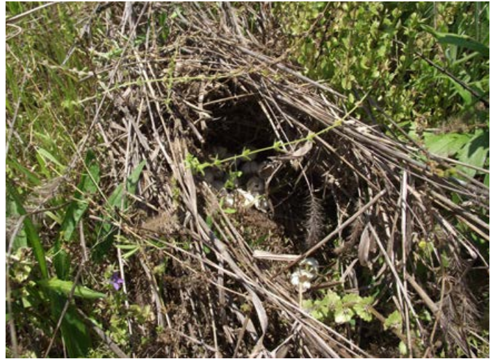
Bobwhite commonly use native grasses for nesting, but they also use dead material from a wide variety of other plants like giant foxtail. This picture illustrates the point that native grasses are not the only material bobwhite use for nesting, especially in areas where herbaceous vegetation is not lacking.

It is a common misconception that fields dominated by native grasses with very few “weeds” are best for wildlife. With the exception of grassland songbirds, there are no wildlife species in the eastern United States that need more than 30%–50% grass cover. Northern bobwhite, pheasants, and ground-nesting songbirds certainly use native grass litter for nesting, but they also will build nests from most any other herbaceous material and place nests near other vegetation that provides structure similar to grasses. For bobwhite, a density of 250 to 10,000 native-grass clumps per acre is more than sufficient for nesting