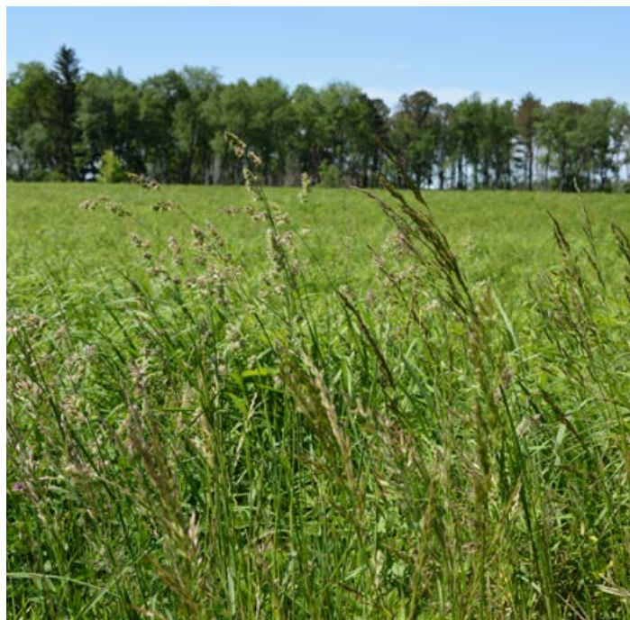
Cool-season grasses, such as tall fescue, orchardgrass, and smooth brome, quickly invade NWSG stands, especially in stands where they were not adequately controlled prior to planting. Cool-season grasses change the structure of the stand at ground level and impede movement and foraging of ground-dwelling wildlife.

Nonnative cool-season grasses including tall fescue, smooth brome, Kentucky and roughstalk bluegrass, timothy, orchardgrass, quackgrass, and reed canarygrass commonly invade NWSG stands, especially when not properly controlled prior to establishment. Taking the time to effectively control cool-season grasses prior to planting with both fall and spring herbicide applications can help mitigate problems later in the life of the planting. Cool-season grasses limit mobility and foraging of upland game bird broods and suppress native vegetation. Cool-season grasses probably are the most common and problematic invaders of early successional areas, but because of differences in phenology (timing of growth) between cool-season and warm-season grasses, cool-season grasses are easily controlled in NWSG stands.