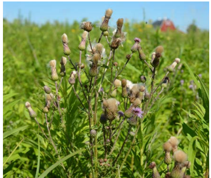
Nonnative biennial (musk thistle; left photo) and perennial (Canada thistle; above) thistles commonly invade NWSG stands and are most effectively controlled with herbicide.