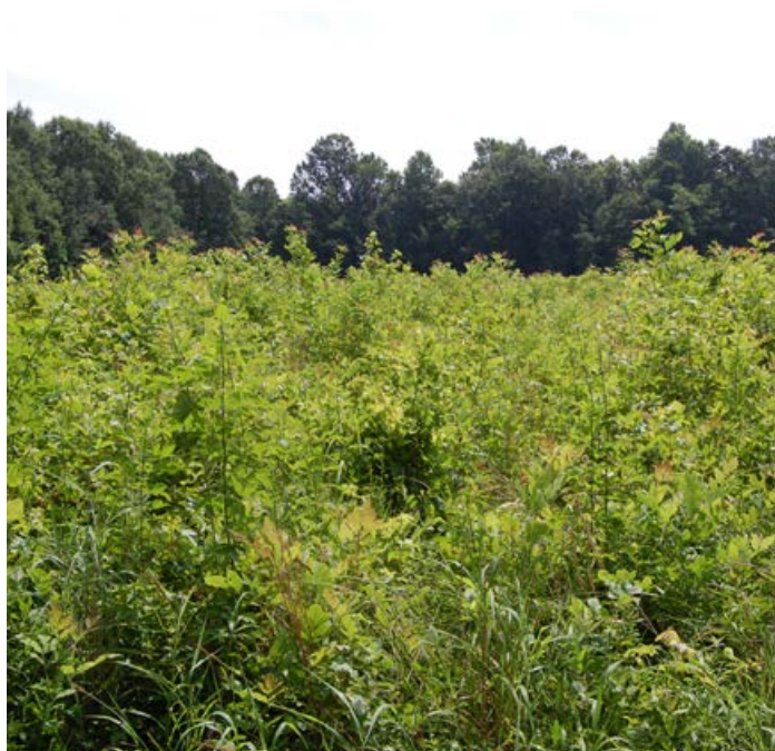
This field is quickly being overtaken by sweetgum, green ash, and red maple. Without management, this field is on its way to becoming a young forest.

Pioneering woody plants include tree species, such as winged elm, Virginia pine, red maple, sweetgum, yellow-poplar, cottonwood, green ash, black willow, sassafras, sweetgum, eastern redcedar, persimmon, black locust, and honeylocust. These species may provide vertical structure used for perching, thermal protection, or brooding or escape cover when they are young, but over time, they grow taller, out-compete herbaceous vegetation, and dominate the stand. That being said, make no mistake, the presence of some woody species makes the area much more attractive and productive for many wildlife species.