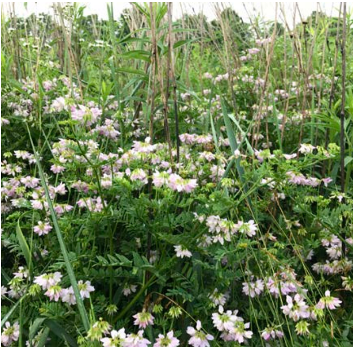
Crown vetch is commonly found along roadsides, but also invades NWSG stands.

Crownvetch is a nonnative perennial legume often promoted for erosion control and as a forage for cattle. However, crownvetch is very invasive and quickly invades NWSG stands. Eventually, crownvetch will outcompete native vegetation and form a monoculture. Crownvetch is a cool-season plant and can be controlled when most desirable warm-season vegetation is dormant. Crownvetch is best controlled with products containing triclopyr (1qt/ac), metsulfuron methyl (0.5 oz/ac), or aminopyralid (5–7 oz/ac). Small infestations also can be controlled with glyphosate (2 qt/ac) or 2,4-D (4–6 pt/ac).