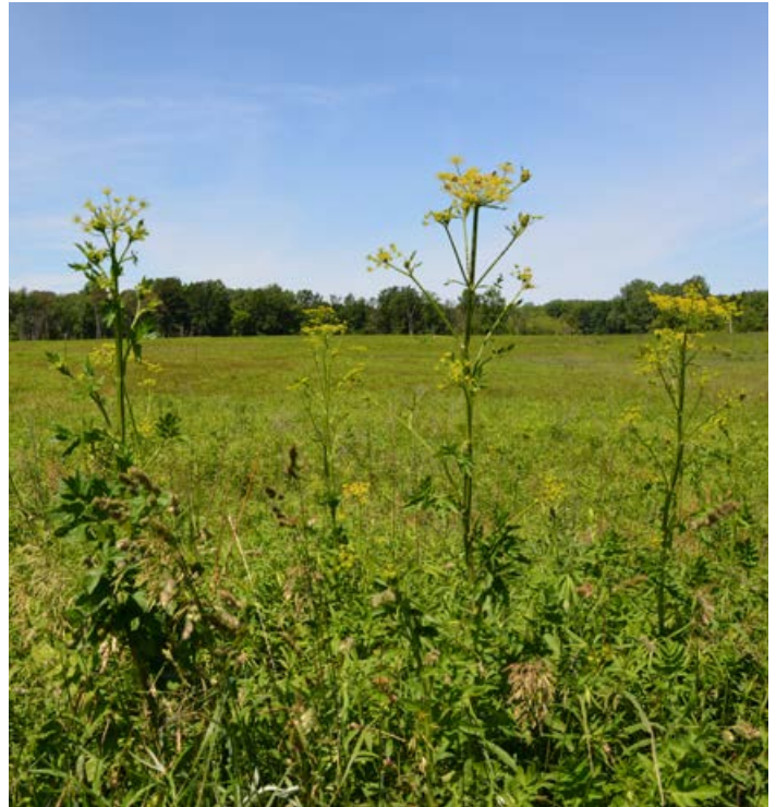
Wild parsnip is a nonnative invasive forb common in NWSG stands of the Midwest and northern United States.

Wild parsnip is an invasive biennial/perennial broadleaf common in planted NWSG stands and other early successional areas. Parsnip is most common in the Midwestern and northern U.S. and can cause phytophotodermatitis, a condition leading to rashes, blistering, and discoloration of the skin after contacting secretions from wild parsnip. Wild parsnip is controlled best with applications of 2,4-D (4 pt/ac), 2,4-D + triclopyr (4 qt/ac), or 2,4-D + dicamba (4–5.6 pt/ac), but also can be controlled with metsulfuron methyl (1.5–2 oz/ac), glyphosate (2 qt/ac), dicamba (2–4 pt/ac), and imazapyr (Arsenal®, 2–3 pt/ac).