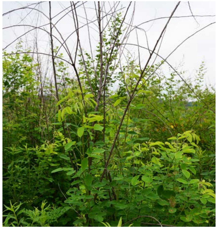
Shrub lespedeza commonly invades NWSG stands in the southern United States and the use of prescribed fire only enhances its invasiveness. Herbicide should be used to control invasions.

Shrub lespedezas. Federal, state, and non-governmental conservation organizations often cultivated, promoted, and planted bicolor lespedeza, Thunberg lespedeza, and other shrub lespedezas to provide woody cover and seed for northern bobwhite. Make no mistake, shrub lespedezas are NOT needed to manage for northern bobwhite! More common in the southern United States, shrub lespedezas are very invasive and form dense thickets in NWSG stands and throughout woodlands where prescribed fire is used. The invasive nature of this plant quickly shades-out desirable plants. Shrub lespedezas are still cultivated and sold, but are no longer recommended for wildlife, and many states consider them an invasive plant. Prescribed fire is not an effective tool to manage shrub lespedezas because of resprouting, and prescribed fire can enhance the germination of shrub lespedeza seed leading to further invasions. Shrub lespedezas are controlled with applications of triclopyr (Garlon 4®, 4–8 qt/ac), metsulfuron methyl (2–3 oz/ac), or glyphosate (3–4 qt/ac).