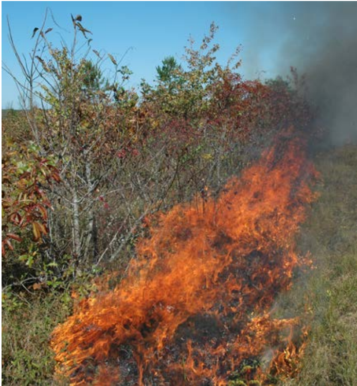
Late-growing season is the most effective time to conduct prescribed fire with the objective of reducing woody encroachment.

Frequent dormant-season fires (1–2 yr return intervals) may limit woody encroachment and control certain invasive species, but it also will increase native grass density and lead to reduced forb abundance. Infrequent dormant-season fire will top-kill woody stems, but these stems readily resprout. Burning during the latter portion of the summer/early fall (August–October) tends to control woody encroachment better than during the dormant season or early portion of the growing season. However, a single fire rarely causes dramatic shifts in plant composition. Multiple fires are required to see considerable reduction in woody encroachment. Fire may not be possible in some areas, and woody encroachment may advance beyond what is feasible to control with a single prescribed fire, and an herbicide application or mechanical treatment may be warranted.