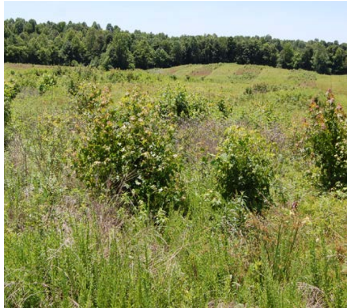
Pioneering tree species (sweetgum and red maple) and sericea lespedeza have invaded this field. In this case, a spot application of triclopyr would be most appropriate because it would control both tree species and sericea. This field could also be burned in late summer to reduce the woody encroachment and prevent sericea from producing seed.

Native shrub species, such as plums, hawthorns, elderberry, dogwoods, sumacs, leadplant, and false indigo, are extremely attractive to many wildlife species that need woody cover and make planted NWSG fields much more desirable to these species. However, you need to provide the correct amount of woody cover in an attractive arrangement for various focal species, and as succession advances, even some of these shrubs can become too dense for various species and management will be needed to control them.