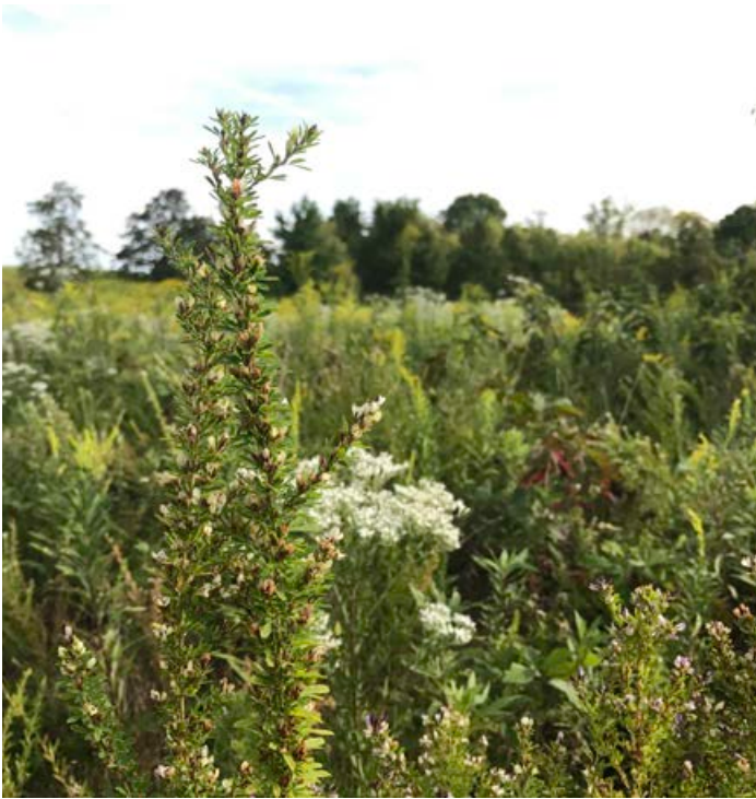
Sericea lespedeza is arguably one of the most problematic invaders in NWSG stands. Sericea flowers in August or September and is a prolific seed producer, but the seeds have no value to wildlife because they are indigestible.

Herbicides to control sericea lespedeza . Glyphosate (1–2 qt/ac), triclopyr (1 qt/ac), or a combination of triclopyr and fluroxypyr (Pastureguard HL® 1.5 pt/ac) provide control of sericea lespedeza throughout the growing season. However, aminopyralid (used to control thistles) is not effective in controlling sericea .