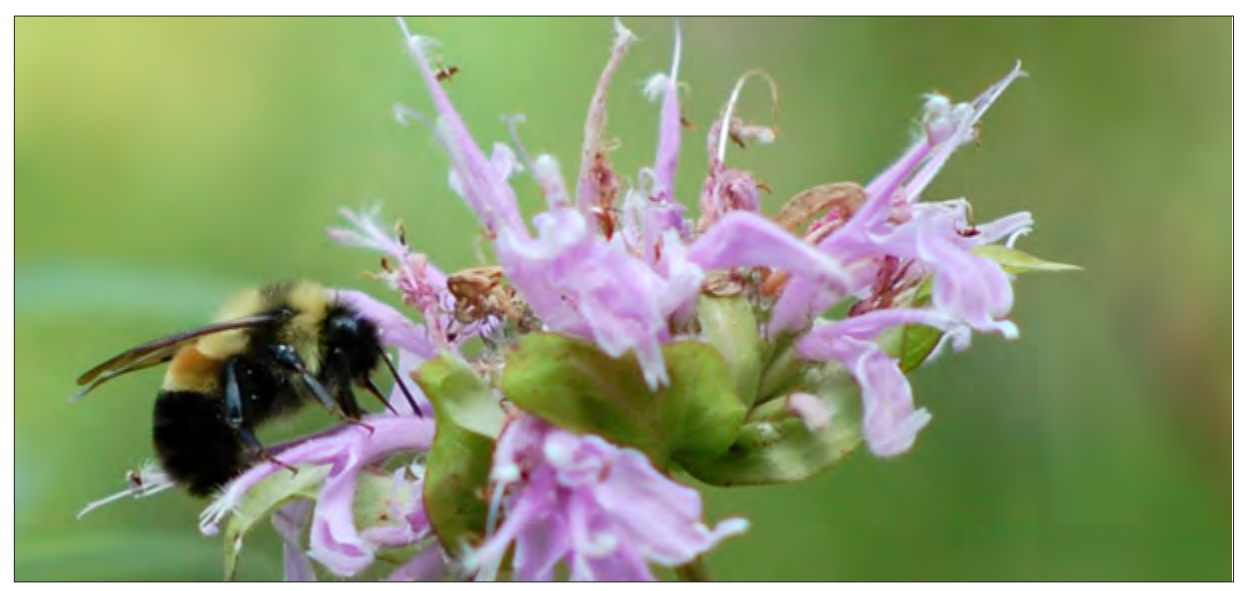
The rusty patched bumble bee (Bombus affinis) nectars on monarda.