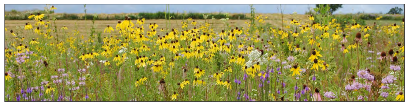
A southern Wisconsin planting of diverse native prairie forbs that provides floral resources throughout the growing season.