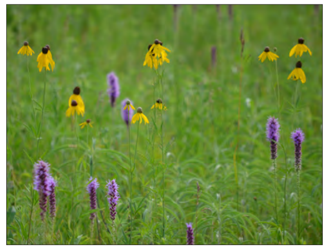
This mesic prairie provides both forage and nesting habitat with a mix of native wildflowers and bunch grasses.