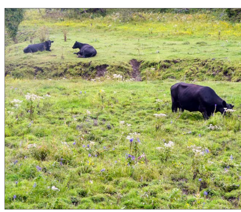
FIGURE 32: Cattle grazing around various native wildflowers, including boneset ( Eupatorium spp.) and blue lobelia ( Lobelia siphilitica ), in Wisconsin.

This technique has been used for interseeding wildflowers into native warm-season bunch grasses like big bluestem and Indiangrass. Fall burn and interseed shortly after burning. Mow or hay (4–6" high) whenever vegetation reaches 12–18" in height from late-May to late-August in the first growing season. This technique is very effective against warm-season grasses, but has low success on cool-season grass stands.