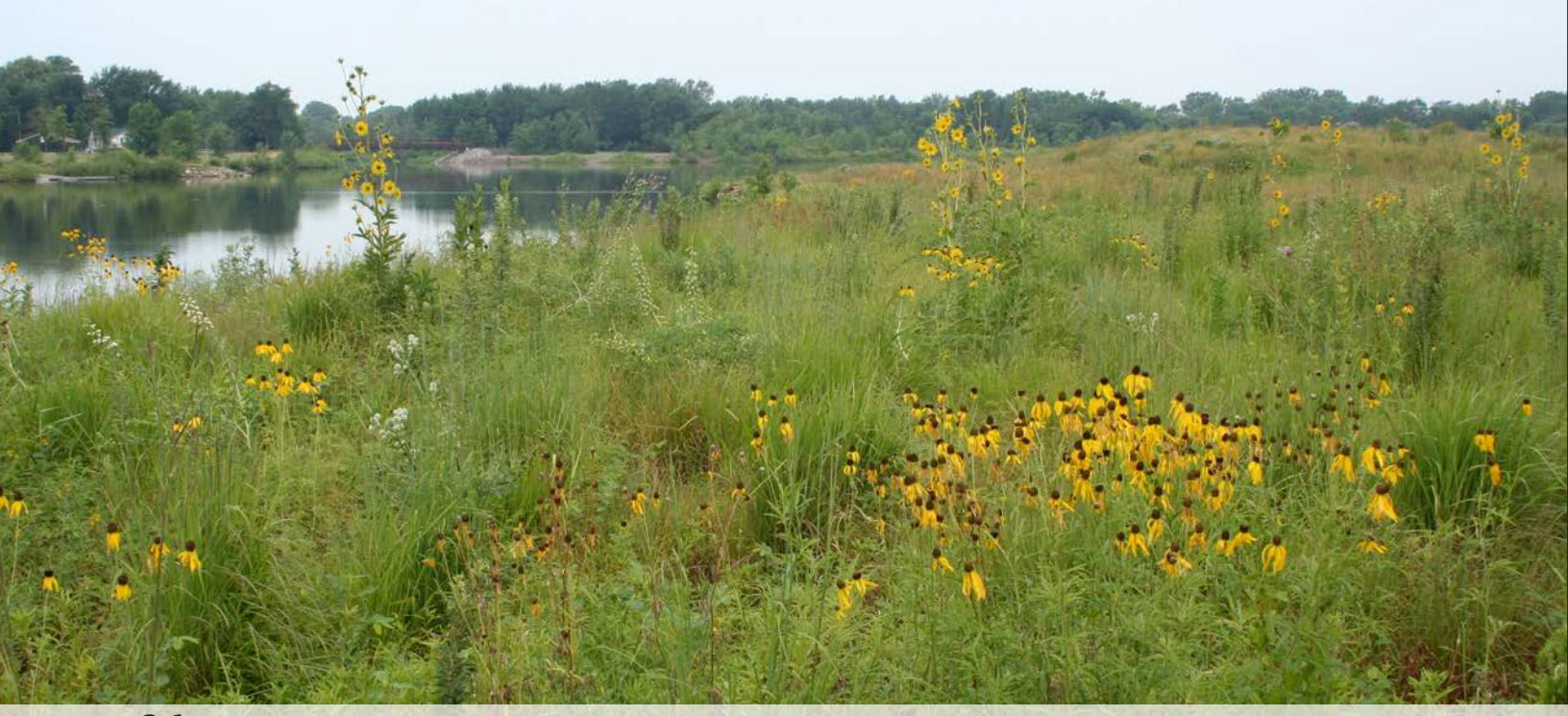
Interseeding Wildflowers to Diversify Grasslands for Pollinators

FIGURE 31: This prairie in Cedar Falls, lowa, was interseeded with 85 species of warm and cool-season grasses, sedges, and wildflowers. Prior to interseeding the site had only a few relic native species as well as non-native cool-season grasses. The site was burned in the spring, then interseeded soon after, and was spring burned annually for three growing seasons in years 3-5 after sowing the seed.