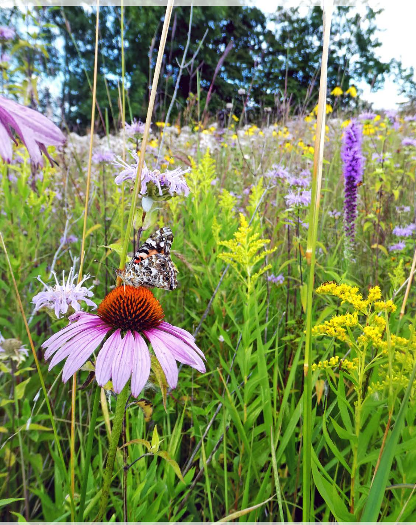
Figure 1: Wildflowers interseeded into grassy areas provide numerous resources for pollinators, including nectar to fuel the migration of the painted lady butterfly ( Vanessa cardui ), shown here.