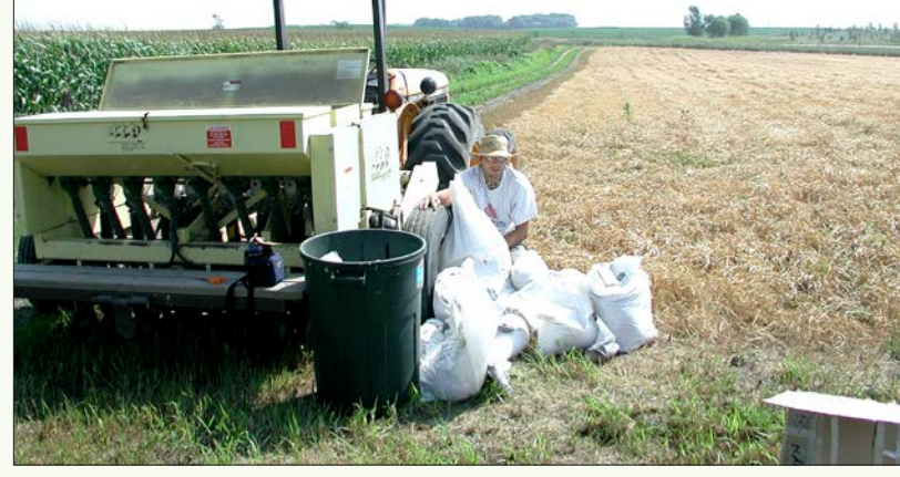
FIGURE 23: Preparing to interseed a 10 acre site previously dominated by cool-season pasture grasses (smooth brome, Kentucky bluegrass, orchardgrass, and tall fescue) with a Truax no-till drill.