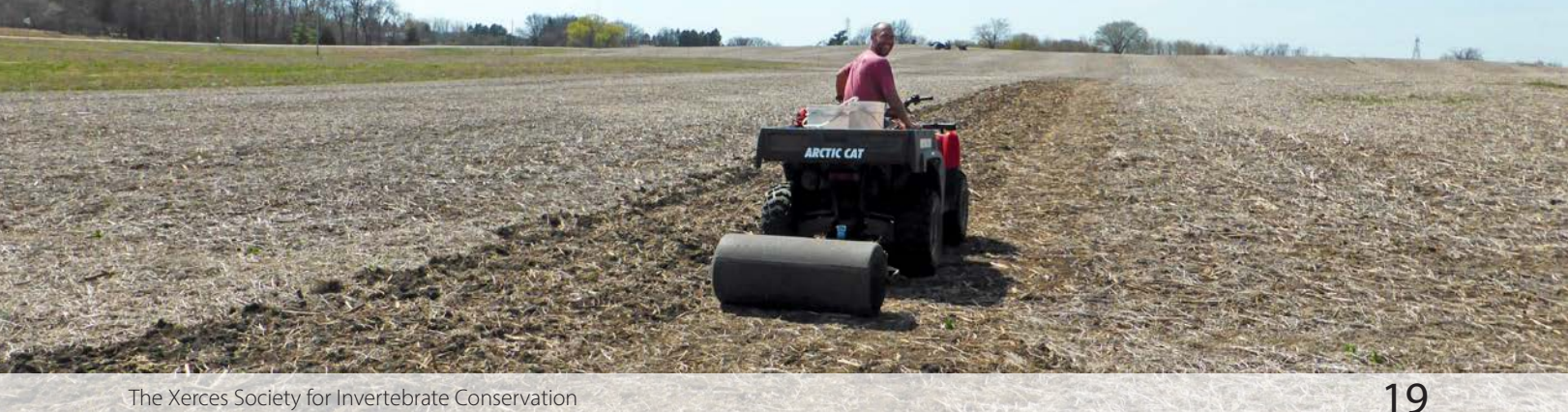
FIGURE 24: After broadcasting seed on a site, following up with a cultipacker or roller is important to ensure adequate seed-to-soil contact.