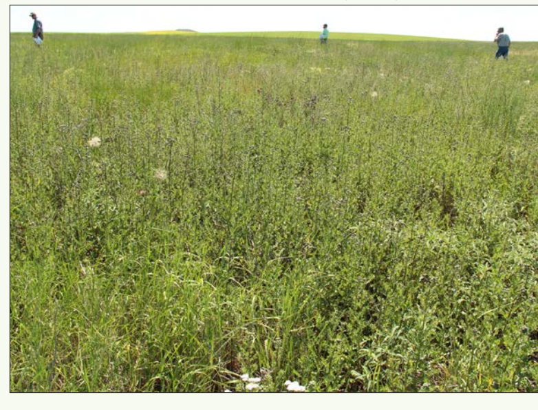
FIGURE 18: Invasive weeds like Canada thistle ( Cirsium arvense ), shown here invading a CRP planting in North Dakota, can crowd out desirable species and reduce plant diversity quickly.

It is important to be familiar with the characteristics of target weeds. Some weed species will set seed lower to the ground when mowed or hayed and may need additional control through spot-spraying or hand-weeding. Other weed species are stimulated by mowing, haying, or grazing and it is not advisable to use these control methods.