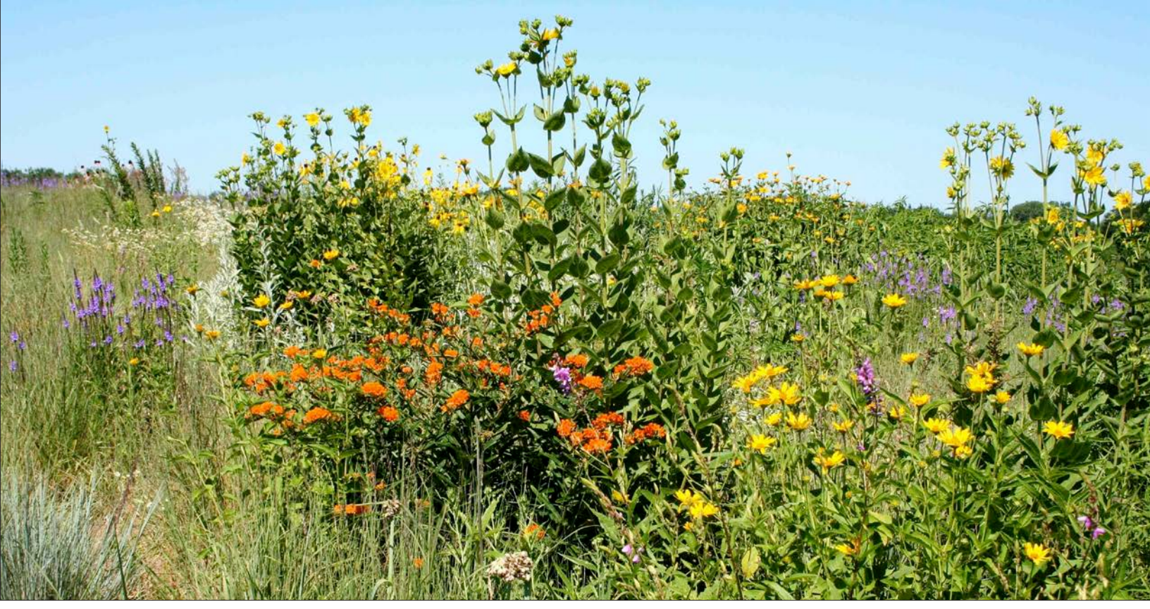
FIGURE 11: Some wildflowers are better than others at establishing into grass-dominated sites; hoary vervain (Verbena stricta), rosinweed (Silphium integrifolium), and butterfly milkweed (Asclepias tuberosa), shown here, are examples of species with high interseeding success rates.

Finally, the likelihood that a species will establish and persist when interseeded should be considered when choosing species. Currently, seed is commercially available for hundreds of native wildflowers. Practitioners agree that some of these wildflowers establish readily when interseeded, while others establish more slowly and may not appear in the planting for many years (or at all) after sowing seed. Based on survey responses from practitioners and review of interseeding research, we have compiled a list of 81 wildflowers in Table 2 (p. 10–12) that are most likely to establish and persist in interseeded plantings and provide abundant resources for bees and other pollinating insects. In addition, in Table 6 (see Addendum) we provide a short list of 21 wildflowers that have consistently persisted after being established in fifteen interseeding projects that were seeded between 1997 and 2010 in eastern Iowa by the Tallgrass Prairie Center. For recommendations on native grasses or sedges to include in interseeding mixes, check with your local NRCS field office.