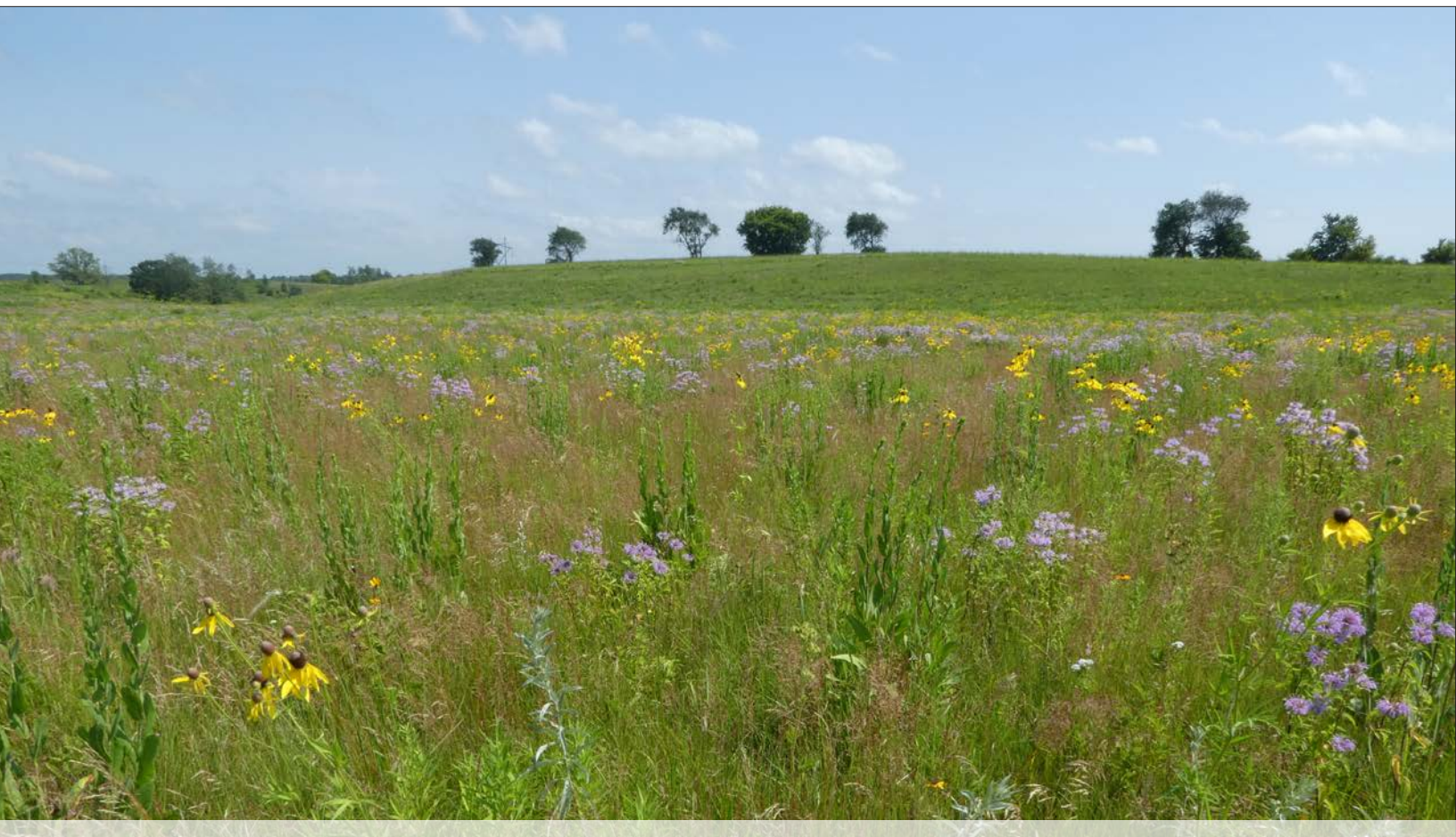
FIGURE 35: This interseeded grassland in Minnesota now provides valuable resources for pollinators.

approaches tailored to address the conditions of the specific interseeding project. Table 5 provides an overview of specific concerns related to wildflower persistence or plant community management in interseeded plantings, along with management options that can be used to address these concerns. (Note that one or more of these options can be applied to a given site.)