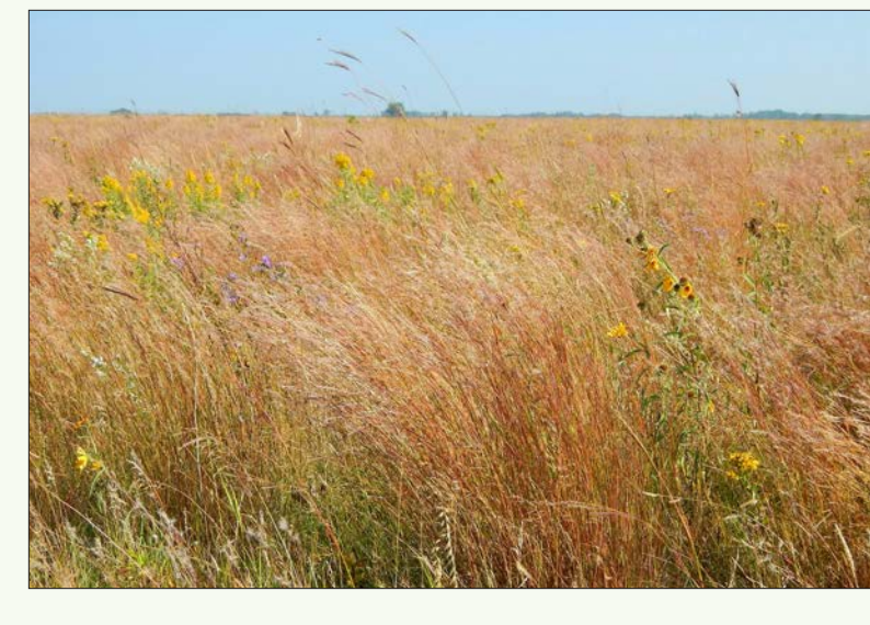
FIGURE 7: Many practitioners use prescribed burns to remove excessive litter before interseeding.

<u>FIGURE 6:</u> Shorter-statured native bunchgrasses, like side-oats grama ( Bouteloua curtipendula ) and little bluestem ( Schizachyrium scoparium ), dominate this site in Minnesota, allowing wildflowers to establish with less competition.