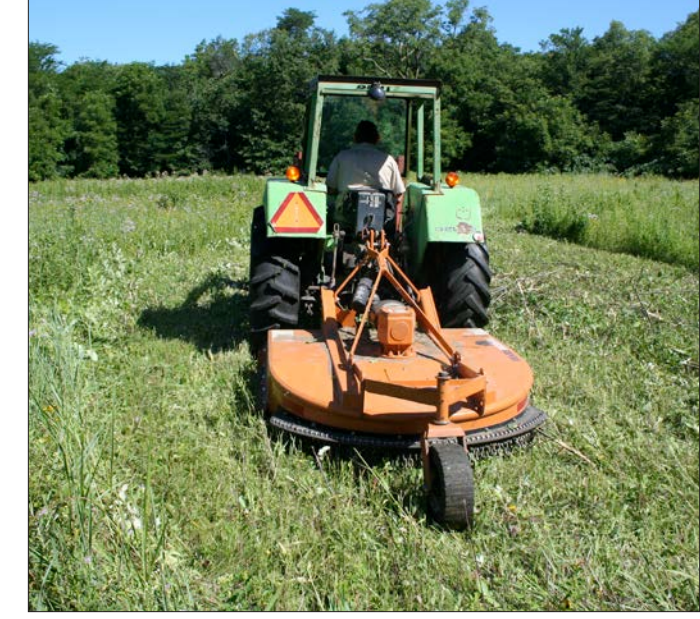
<u>FIGURE 34</u>: Spot mowing with a small rotary mower can be used to control larger brush or weed patches in planted prairies with minimal disturbance to adjacent prairie plants.

approaches tailored to address the conditions of the specific interseeding project. Table 5 provides an overview of specific concerns related to wildflower persistence or plant community management in interseeded plantings, along with management options that can be used to address these concerns. (Note that one or more of these options can be applied to a given site.)