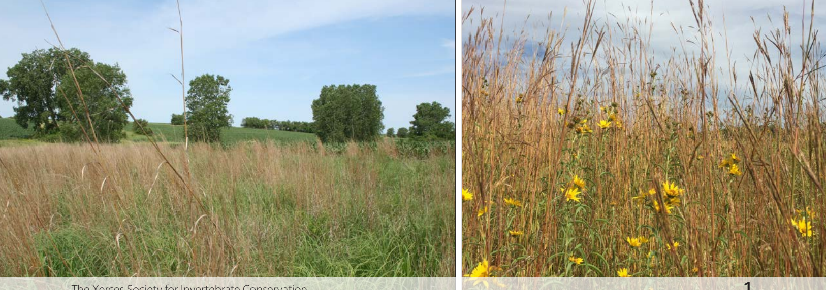
FIGURE 2: On the left, a grass-dominated CRP site provides little value for pollinators. The CRP site on the right was interseeded with various native wildflower species that will both support pollinators and persist in grassland habitat.

The Xerces Society for Invertebrate Conservation