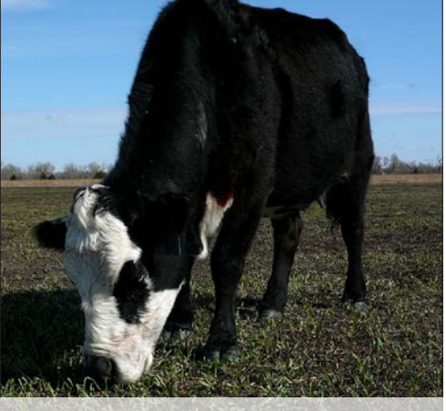
The Xerces Society for Invertebrate Conservation

FIGURE 30: Cow grazing on smooth brome in recently burned patch in restored prairie managed with patch-burn grazing system (left). Following establishment, the site is managed with patch burn grazing (right).