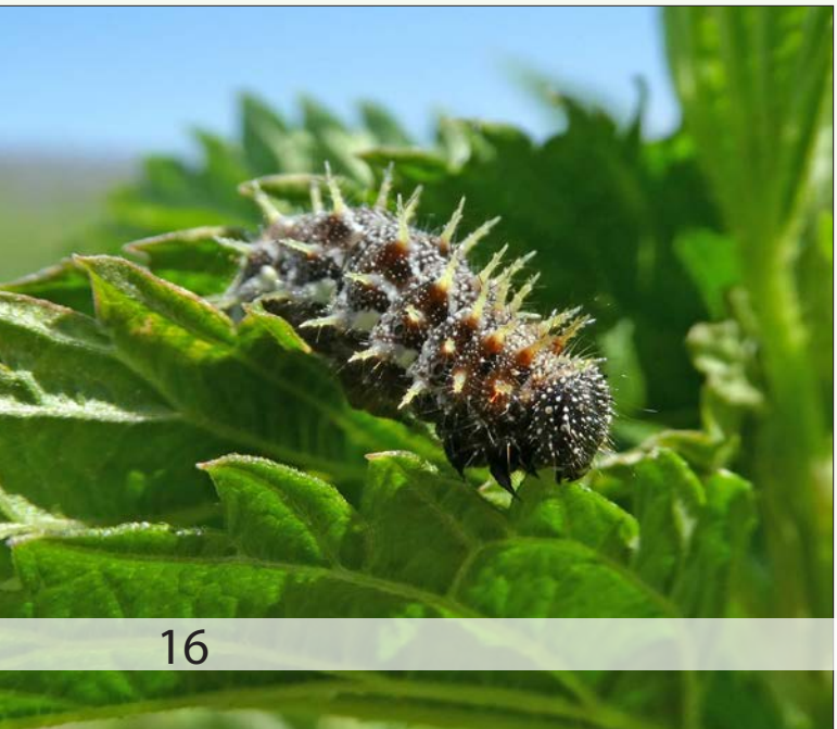
FIGURE 17: While caterpillars (and their host plants) are not the intended targets of grass-selective herbicides, some species can still be harmed by exposure.

If few to no cool-season grasses are present, many practitioners choose to only suppress warmseason grasses when interseeding wildflowers. This can be achieved with a single herbicide application to a warm-season grass stand in mid-summer prior to interseeding wildflowers the following fall or spring. This approach creates a window for wildflower seedling establishment followed by the recovery of warm-season grasses, resulting in a more diverse plant community.