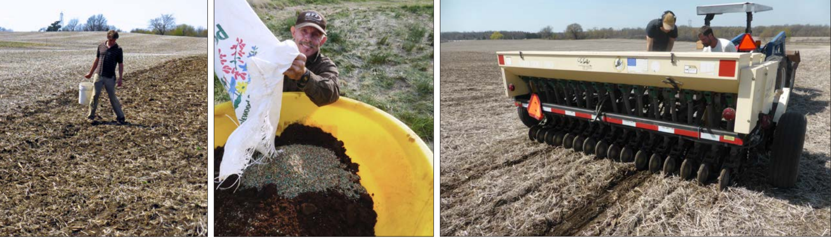
FIGURE 20: Interseeding a site can be done by hand (left) or mechanically, by using a broadcast seeder (middle) or seed drill (right).

FIGURE 21: Snow seeding is an option for interseeding during the dormant season in cold climates. Because seed is broadcast on top of snow, it easy to see seed coverage and achieve even distribution of seed across the site. Snow seeding can be done by hand (top), with a belly crank, or a drop seeder (bottom).