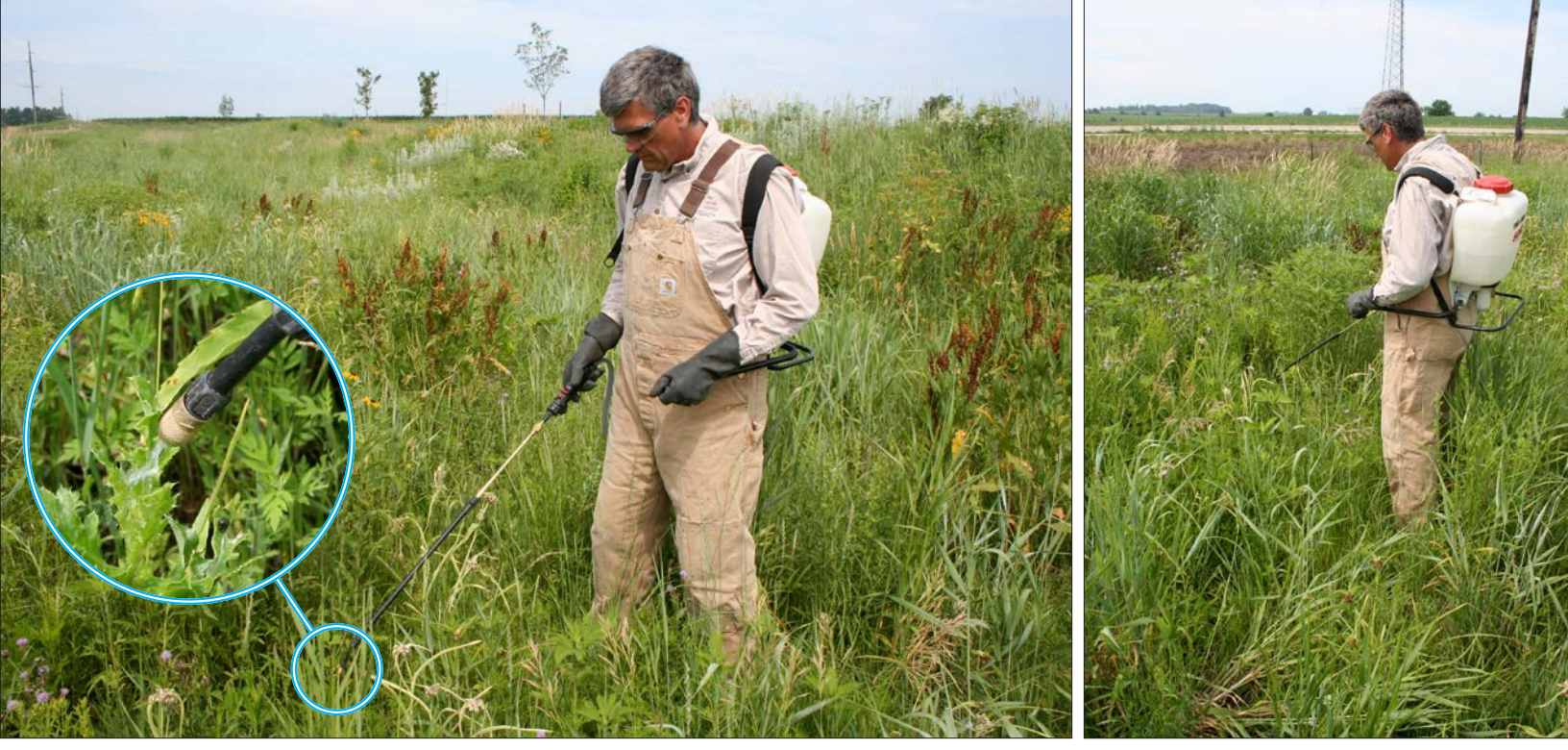
FIGURE 28: Careful spot-spray herbicide application of aminopyralid to Canada thistle in a two-year-old interseeded planting shown in photos above. An after market spray wand extension (left) was added to the backpack sprayer (right) to minimize overspray on adjacent wildflowers.