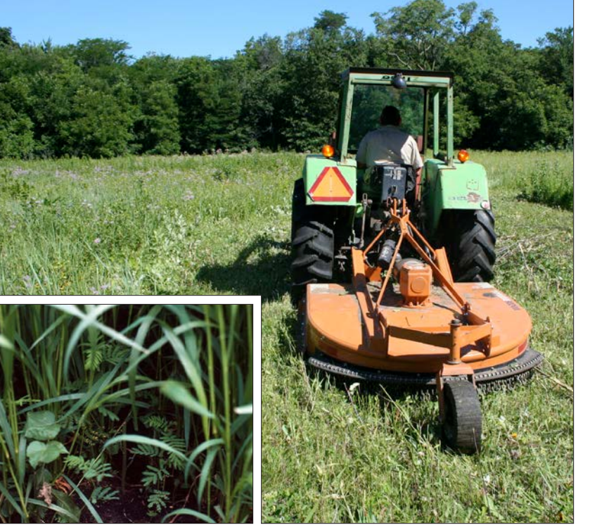
FIGURE 25: Annual weeds (e.g., foxtail) were creating excessive shade on Illinois bundleflower ( Desmanthus illinoensis ) seedlings in a first year prairie planting (left). Establishment mowing in the first year of the new planting removed the shade canopy created by annual weeds and increased sunlight to the slower-growing perennial wildflower seedlings (right).