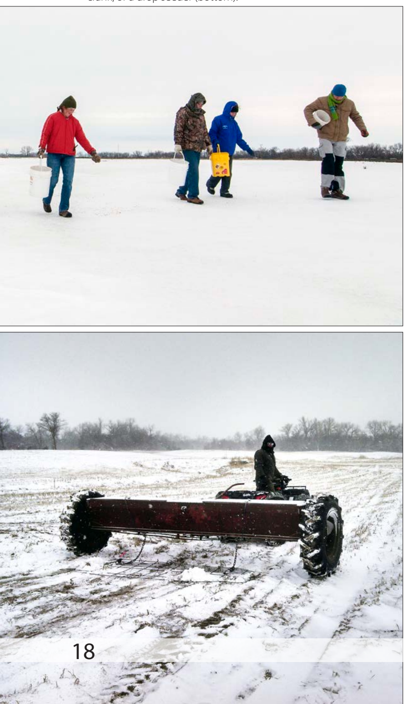
FIGURE 21: Snow seeding is an option for interseeding during the dormant season in cold climates. Because seed is broadcast on top of snow, it easy to see seed coverage and achieve even distribution of seed across the site. Snow seeding can be done by hand (top), with a belly crank, or a drop seeder (bottom).