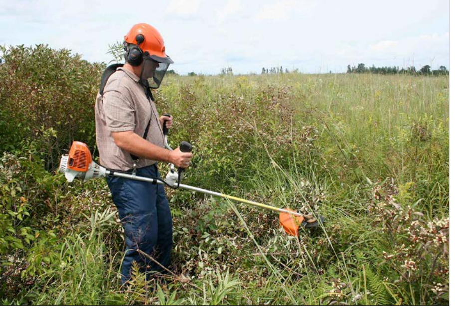
<u>FIGURE 33:</u> Spot mowing (gray dogwood) with a gas powered weed whip (fitted with a brush blade) can be used for brush control for smaller patches in planted prairies. Cut stems should be treated with a cut stump herbicide to prevent re-sprouting.