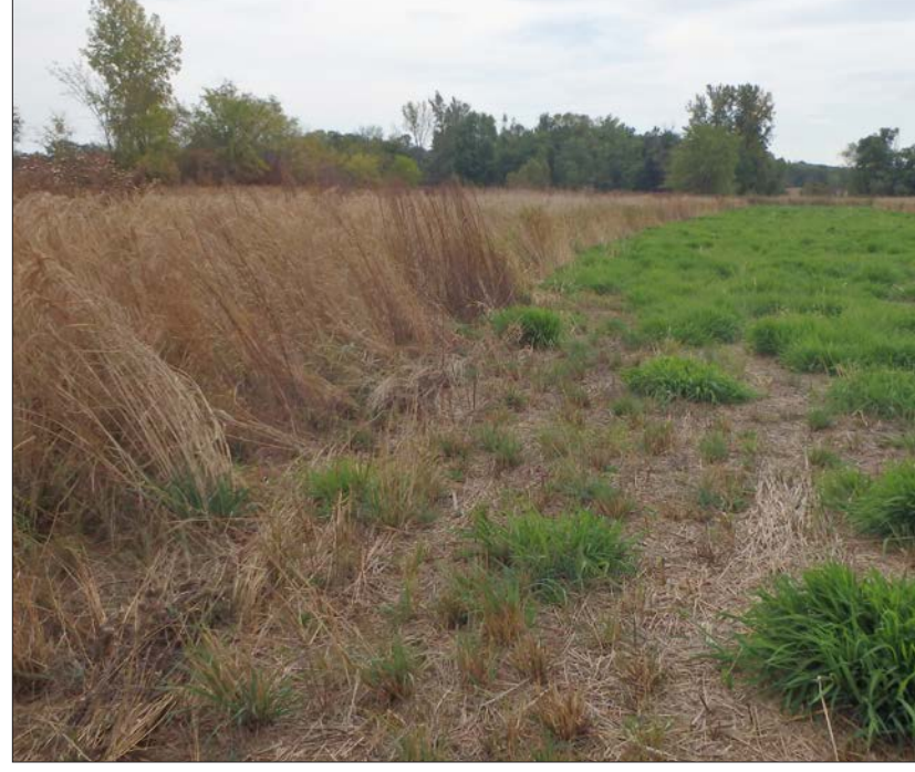
FIGURE 15: Although warm-season grasses and wildflowers persisted in much of this prairie planting, reed canarygrass took over the lower portion of the planting following a flood. The invaded area will be springsprayed with glyphosate and reseeded with wetland natives.

Cool-season grasses should be sprayed in the spring or in the fall shortly before dormancy. Some practitioners believe that control of cool-season grasses is improved with a fall chemical application (as compared to a spring application) because the plant moves more energy into its roots to overwinter during the fall and the chemical moves into the roots more efficiently. To adequately suppress aggressive cool-season grasses such as smooth brome and tall fescue, two consecutive seasons of applications may be needed. A stand initially sprayed in spring should be sprayed again that fall prior to seeding. Likewise, a stand initially sprayed in fall should be sprayed again the following spring before seeding. Of all introduced grassland species, reed canarygrass is