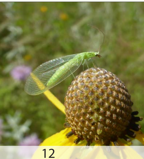
FIGURE 12: Diverse native wildflower species interseeded into this Minnesota natural area support beneficial insects and pollinators. From left to right: green lacewings ( Chrysoperla sp.) on gray-headed coneflower ( Ratibida pinnata ), pure green sweat bee ( Augochlora pura ) on butterfly milkweed ( Asclepias tuberosa ), monarch ( Danaus plexippus ) on showy goldenrod ( Solidago speciosa ).