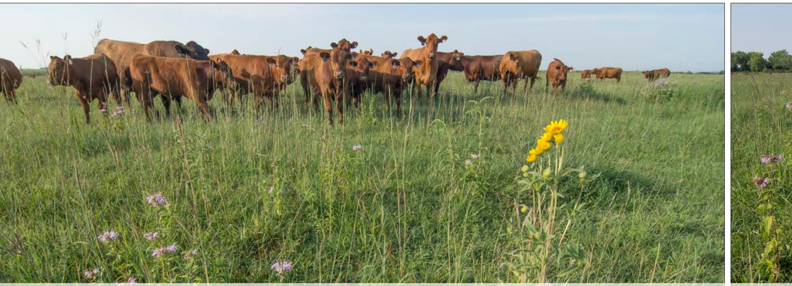
FIGURE 26A: Cattle grazing in a patch burn grazing system on this Nebraska prairie (left) that was previously interseeded in 2011, using fire and grazing to suppress grasses and remove litter.

Some practitioners have observed improved wildflower establishment under intensive grazing with short duration aimed at knocking back the grasses during the first year after interseeding. They note that carefully timed and planned grazing during establishment and suppresses the grasses, allowing