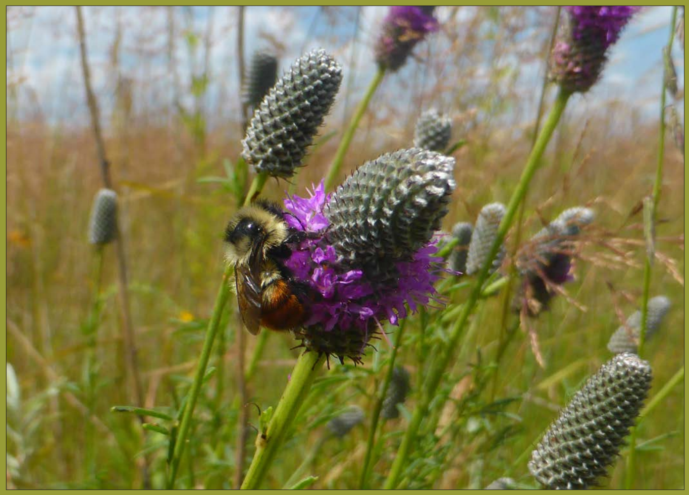
Red-belted bumble bee (Bombus rufocinctus) visiting purple prairie clover (Dalea purpurea) on an interseeded prairie in Minnesota