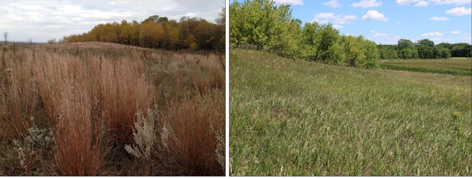
<u>FIGURE 5:</u> Wildflower establishment is most successful when interseeding into stands of short native bunch grasses, such as little bluestem (left). Plantings dominated by introduced cool season grasses like smooth brome (right) require more aggressive control prior to interseeding wildflowers.