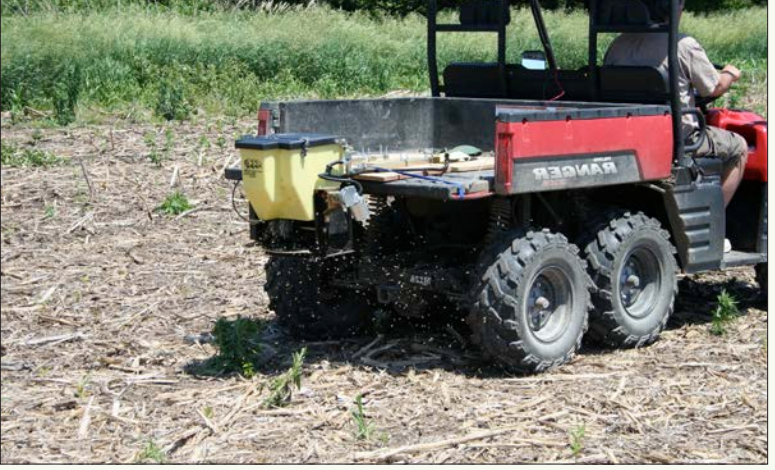
FIGURE 22: Broadcast seeding (Truax Seed Slinger) native plants. The site was cultipacked (FIGURE 24) after seeding to improve seed-tosoil contact.