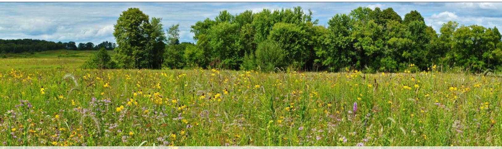
FIGURE 37: Diverse wildflowers blooming in Wisconsin prairie after successful restoration from degraded grassland.