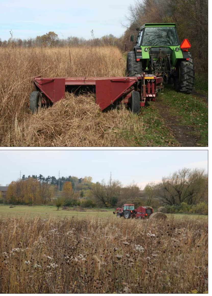
<u>FIGURE 27:</u> Cutting prairie hay (top) in fall for baling. Fall (dormant) haying can be used to remove litter prior to interseeding wildflowers or as a long-term management strategy to reduce volunteer trees and shrubs, and promote native plant growth (bottom).

Mow before grasses begin to form a canopy that casts shade over the wildflower seedlings. A good rule of thumb is to mow when grasses are knee-high, reducing their height to 8". Research from a Plant Materials Center indicates that first mowing when grasses are shorter may better promote wildflower establishment than waiting for grasses to grow to knee-high. Mowing should coincide with the active growth periods of the grasses being controlled: early spring to early summer for cool-season grasses and late spring through summer for warm-season grasses. To minimize damage to the seedlings, mow no lower than 4" and increase the height of the mower as the first growing season progresses and the wildflower seedlings grow. Grass clippings can build in the wheel tracks of some mowers and kill seedlings; to avoid this, alternate directions each time you mow so the mower does not go over the same tracks repeatedly.