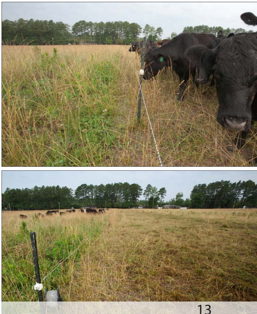
FIGURE 13: Grazing a site intensively for the entire growing season (top) to prepare for interseeding can be effective (bottom).

There are three basic grazing levels: intensive (heavy), moderate, and light. Under intensive grazing,