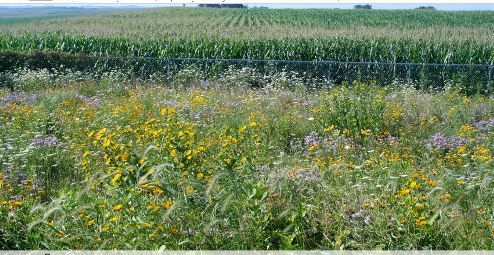
Interseeding Wildflowers to Diversify Grasslands for Pollinators

FIGURE 10: Three years after being interseeded, this planting bordering crop fields is rich in native wildflower species suited for the area.