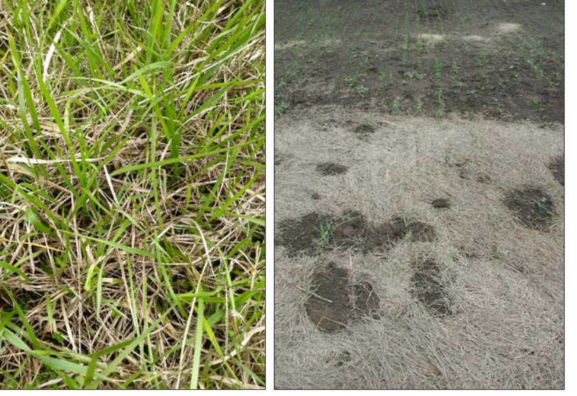
<u>FIGURE 8:</u> On the left, excessive litter from tall fescue ( Schedonorus arundinaceusa ) invasion. The planting on the right was burned in the fall prior to seeding using a native seed drill. In places where thatch was unburned, seedling emergence was decreased.