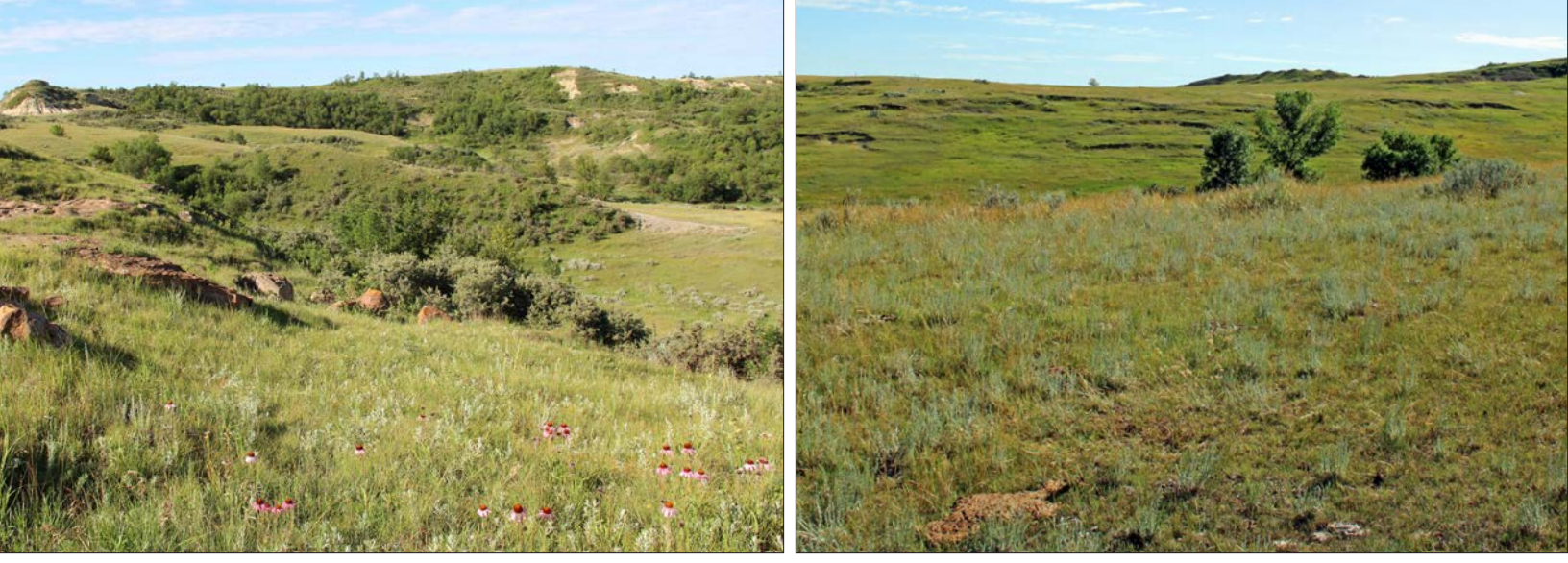
FIGURE 16: Disking should never be used on rangeland or prairie (left). If management cannot return plant diversity on degraded rangeland (right), interseeding following a non-disking method of grass suppression is an option.

reported by practitioners to be the most aggressive and difficult to treat. Interseeding wildflowers into reed canarygrass may require multiple herbicide treatments over multiple consecutive growing seasons before interseeding.