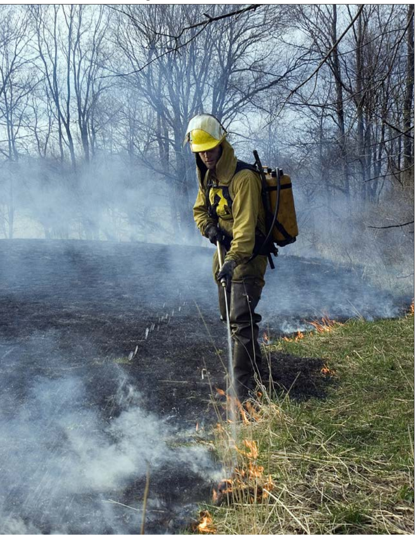
FIGURE 14: Burning is an effective technique to remove litter before interseeding.

Timing is critical to suppress grass using burning, haying, or mowing. As with other grass suppression disturbances, time the disturbance to coincide with the active growth stage (boot stage) of the grass; burning, haying, or mowing in spring and/or fall to knock back cool season grasses and mid to late summer to target warm season grasses. Practitioners have found that burning, haying, or mowing grasses in the boot stage will suppress growth for the rest of the growing season; however, it may require multiple disturbances of this kind to achieve longer-term suppression. Research on March interseeding in an eastern Nebraska prairie restoration dominated by big bluestem found that few milkweed or other wildflower species establish in the absence of disturbance.