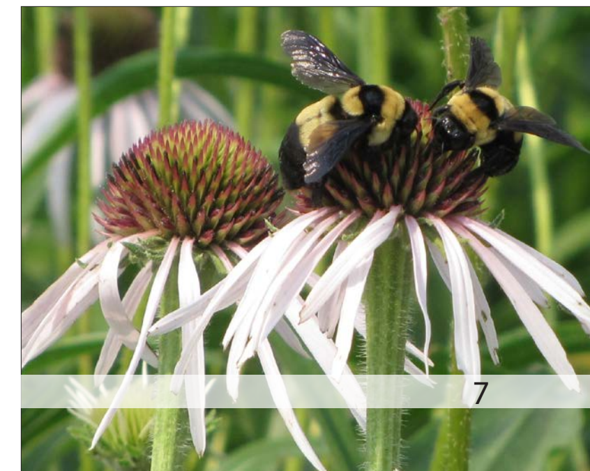
FIGURE 9: Pale purple coneflower ( Echinacea pallida ), a wildflower attractive to pollinators, has the best chance to establish and persist when planted in dry to dry-mesic soils and likely will not establish when planted in sites with wetter soils.

Detailed information about Ecological Sites can be found in NRCS's Ecological Site Descriptions (ESDs). ESDs include site characteristics, plant communities, management options for sites, and supporting resources. ESDs, as well as descriptions of soil and forage plants for grazing animals (Forage Suitability Groups) can be found here: <u>https://esis.sc.egov.usda.gov/Default.aspx</u>.