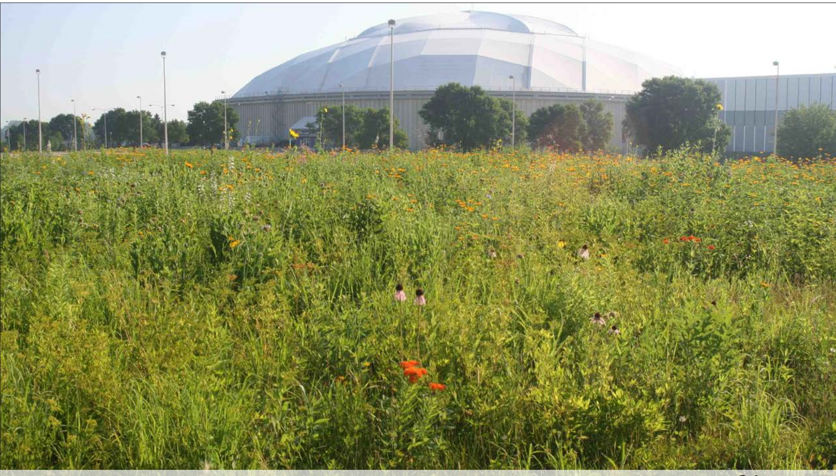
FIGURE 36: This planting on a college campus was interseeded with 50 species of prairie grasses and wildflowers, using a no-till drill in the fall.

Pollinators are in decline and now is the time to embrace opportunities to enhance habitat to support pollinators. Interseeding is one strategy to consider to increase plant diversity in species-poor grasslands, and offers an opportunity to diversify the millions of acres of CRP and conservation lands in the United States and provide pollinators with much-needed resources. Interseeding can be tailored to best fit the soil and climate conditions, experience of the producer or practitioner, and equipment available. Practitioners have been successfully interseeding wildflowers into species-poor grasslands for many years. It is our hope that by bringing together current best practices of interseeding in the Midwest and Great Plains states, this document will enable additional practitioners and land managers to increase diversity in their grasslands through interseeding.