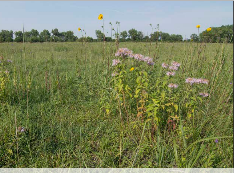
FIGURE 268: More than six years later, the wildflowers (left) are surviving well and providing important resources to prairie specialists, like the regal fritillary butterfly ( Speyeria idalia , right), that can thrive in patch burn systems if rotating portions of the land are left unburned as a refuge.

The Xerces Society for Invertebrate Conservation